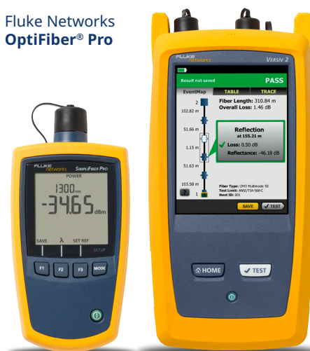
Fluke Networks SimpliFiber® Pro