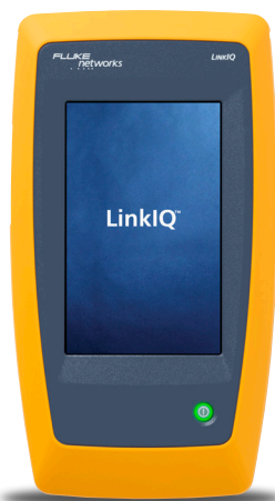
Fluke Networks LinkIQ™ Cable+Network Tester