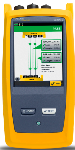
Fluke Networks CertiFiber® Pro

where multiple teams are involved in the testing process, with varying media types and multiple testing requirements. The DSX is part of our Versiv™ modular design platform that supports copper certification, fiber optic loss, OTDR testing and fiber end-face inspection in one.