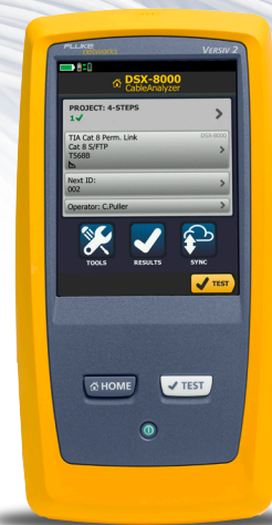
Fluke Networks DSX2-8000