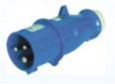
IEC60309 16A 2P+E plug